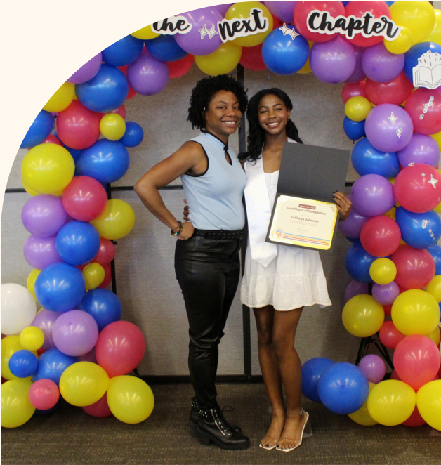
Mom and daughter, share smiles at our 2024 Graduation Banquet