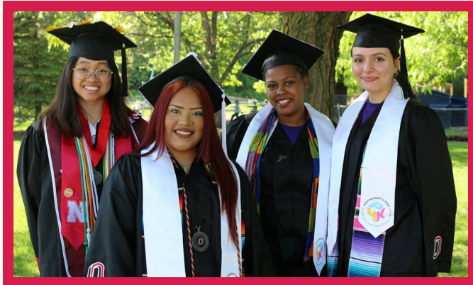
Our 2024 graduating AmeriCorps members.

In the last quarter, we celebrated 98 high school and postsecondary graduates at our 2024 Graduation Banquet. We awarded 54 scholarships to outstanding students. Students and their families were beaming as we celebrated the incredible accomplishments that these students have worked so hard to achieve.