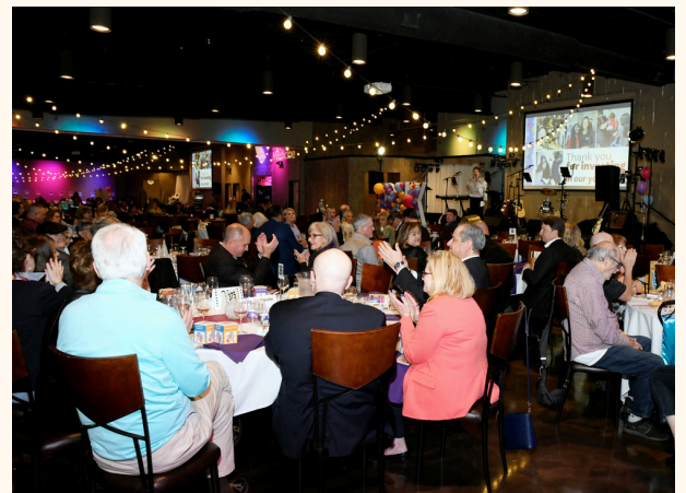
Hops & Grapes, April 2024 at A View On State.

Thank you for being an integral part of the Partnership 4 Kids family. Here's to many more years of success and celebration!