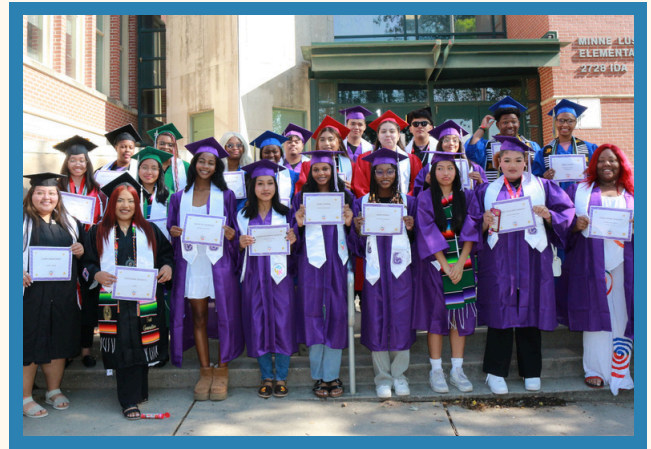
Graduating students during our 2024 Graduate Walks!