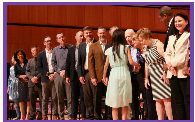
Board members and volunteers shaking a students' hand at our 2024 Goal Achievement Honors Ceremony.

As we look ahead, we remain committed to our mission of empowering youth through education and mentorship. Congratulations to all our graduates, and here's to the many more successes to come!