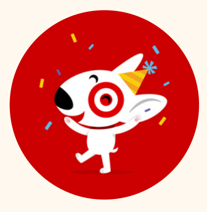
Start earning points <u>TODAY</u> to save and vote for P4K Jan-Mar 2025!